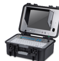
1 × Control Box