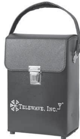
CARRY CASE (OPTIONAL)