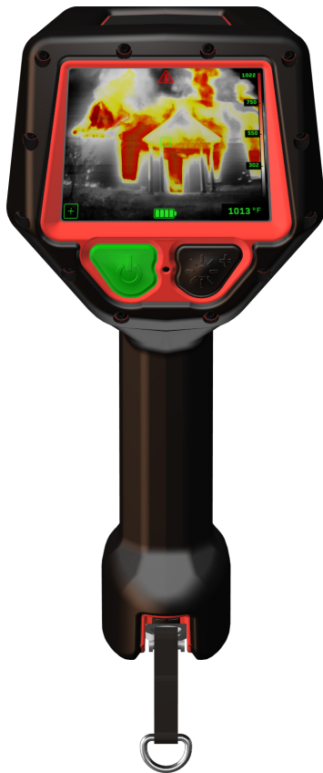
AttackPRO Kit: FQ-PAAX 5yr Enhanced Warranty: WA-5USATTACKPRO

Seek AttackPRO is our most robust handheld thermal imaging camera yet. Extremely durable with simple controls, AttackPRO combines a high-performance 320 x 240 thermal sensor in an ergonomic, fire ground rated package to help you attack fires smarter and more safely. Additionally, a powerful 300-lumen LED light is available at the touch of a button. The AttackPRO delivers unprecedented high-resolution thermal imaging in an affordable firefighting system.