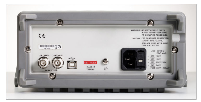
2110 rear panel.