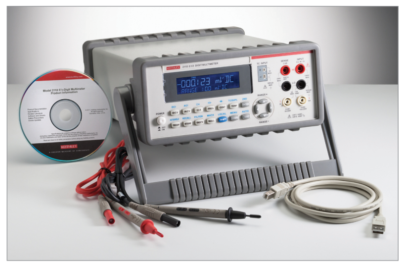
All accessories, such as start-up software, USB cable, power cable, and safety test leads, are included with the 2110.

LabView, IVI-C, and IVI-COM drivers are also supplied to allow for increased flexibility in integrating the 2110 into new and existing systems and test routines.