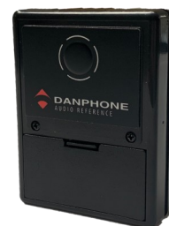
Audio reference 152.4002.004

Contact danphone@danphone.com for price and availability.